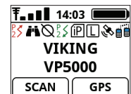
Day - High Contrast

Day & night user selectable display options (8 themes available)