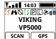
Day - High Contrast

Day & night user selectable display options (8 themes available)